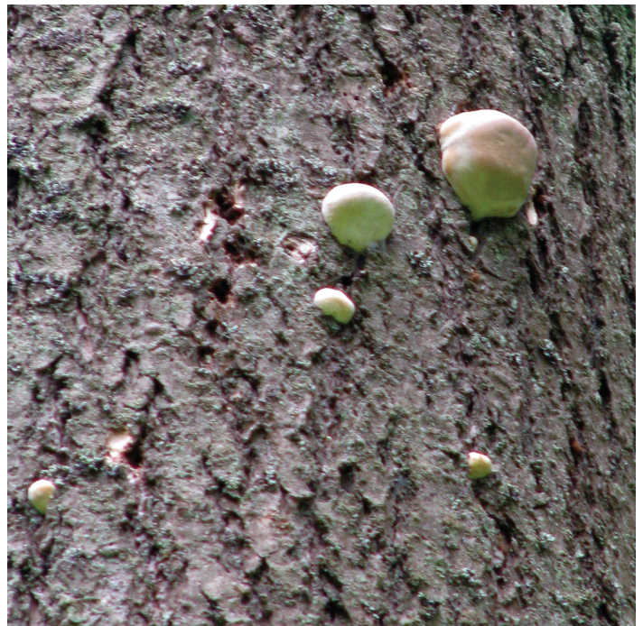
Figure 6. Fungal fruiting bodies (conks) on tree stem.