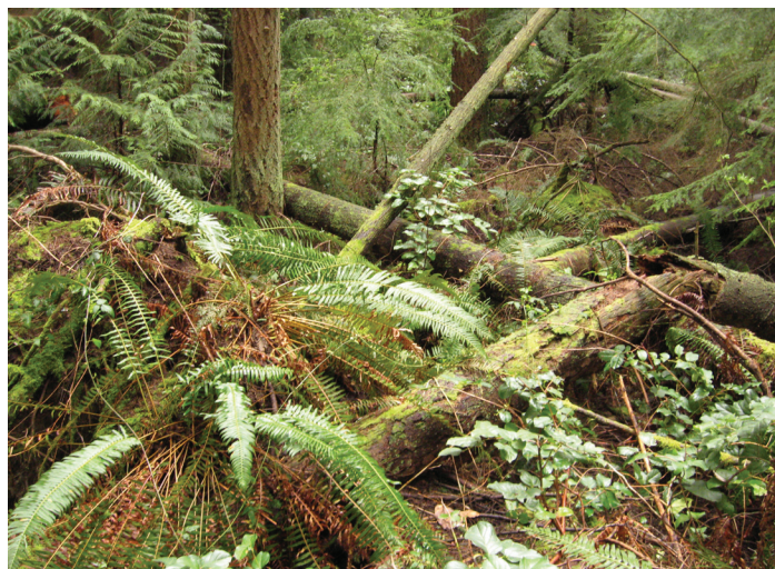
Figure 1. Downed trees in a root rot pocket.

Native trees have evolved together with native pathogens, and these pathogens, in turn, have a natural and important role to play in diversifying the physical structure of the forest, eliminating the weakest trees, and increasing the variety of tree species present. Consequently, removing all diseases or pests is not the answer and would result in negative ecological consequences.