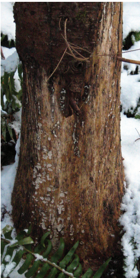
Figure 7. Scraped off bark at base of tree.