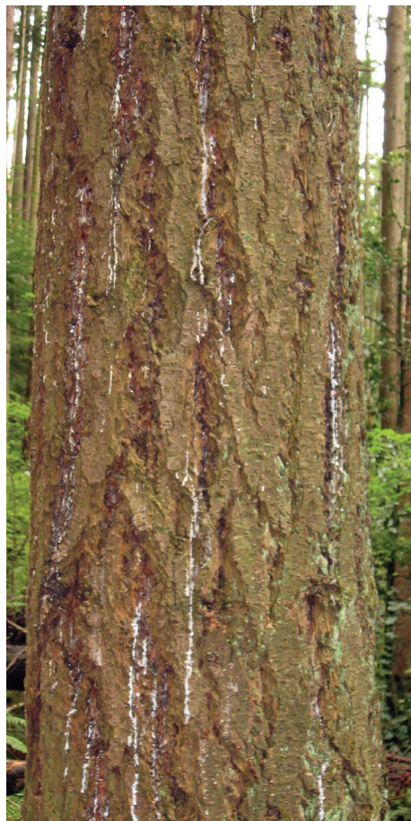
Figure 8. Streaming pitch on tree stem.