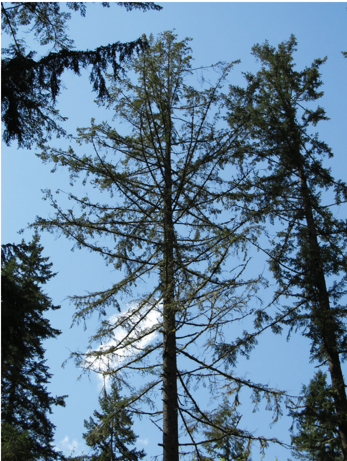
Figure 3. Uniformly fading crown and shortened leader growth.