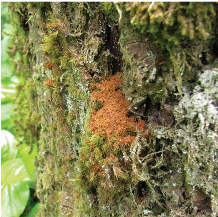
Figure 5. Piles of wood dust in bark crevices.