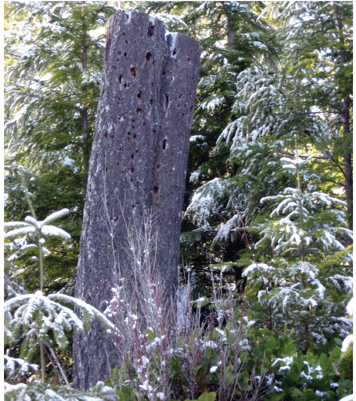
Figure 10. Tall stump for possible wildlife habitat.

Remember that if you do have a tree with a serious problem that is likely to kill it or weaken its structure, you do not necessarily have to remove it. If the tree is not a hazard, you may wish to simply let nature take its course, and look forward to a future snag and the habitat it will provide for all sorts of interesting wildlife. If you do decide to take it down, consider leaving the bottom portion of the tree as a short snag, (which has much less potential to cause damage), to maintain the huge benefits to wildlife. Even a tall stump (Figure 10), between 3 to 5 feet, can be used by wildlife or become a "special feature" of your forest or yard.