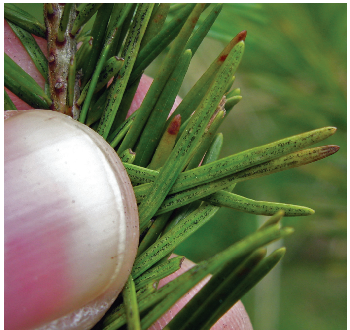
Figure 4. Yellowed needles and sooty black spots.