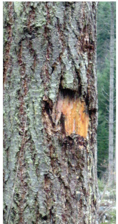
Figure 9. Damage from logging equipment.