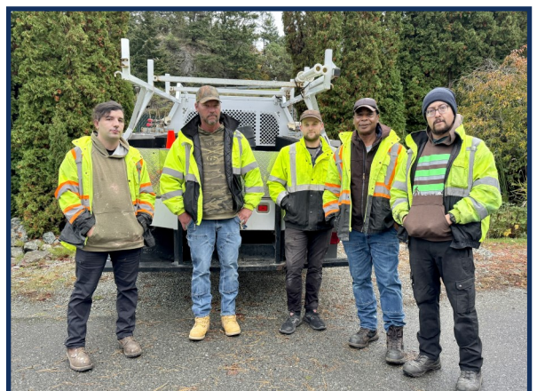
Shelter Bay Maintenance Crew