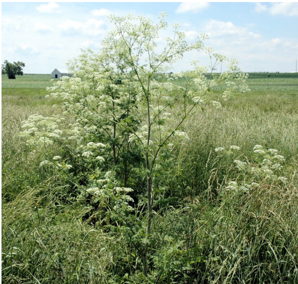
Photo of Poison Hemlock

This presentation will cover noxious weed basics, and best practices for identifying and controlling some of the most common noxious weeds in the Shelter Bay area.