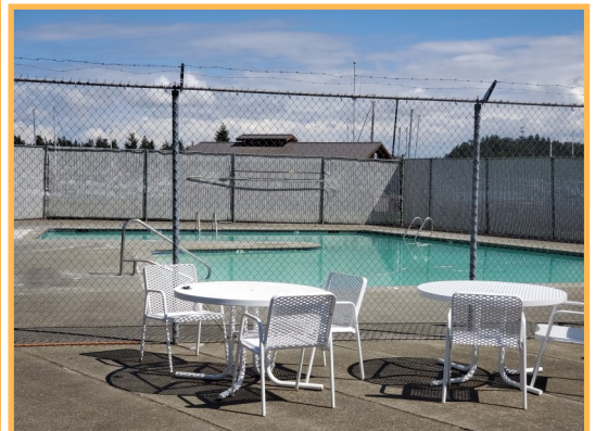
Pool area after weeding.