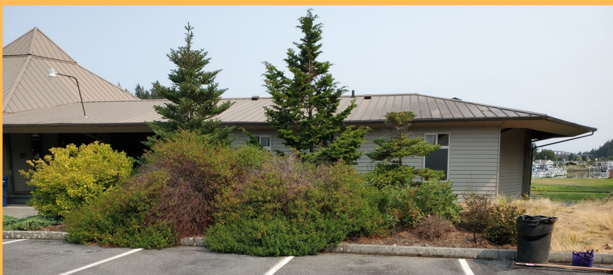
The Garden Club is looking for a work party to renew this area.