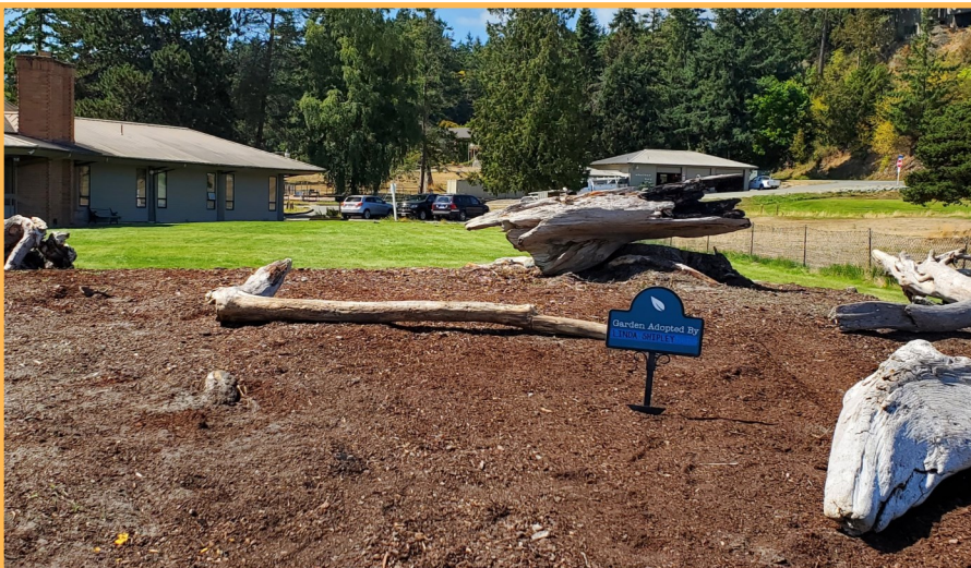
Garden Club member recently adopted and groomed this area.