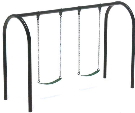
3.5" Arch Swing Frame 8ft - 1 Bay SKU: PGBASF-350801

Use Zone: 45ft x 33ft Child Capacity: 46 Play Activities: 19