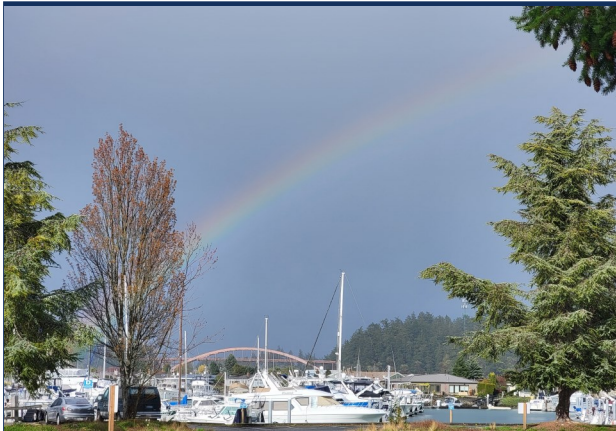
Rainbow Over Rainbow Bridge