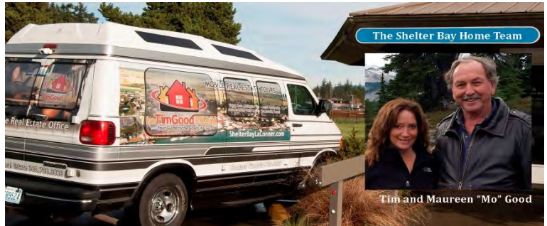
The Shelter Bay Home Team