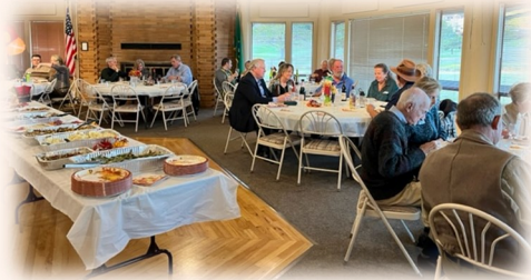
Thanksgiving Dinner Tradition Returns to Shelter Bay Clubhouse

Thank you Social & Recreation Committee!