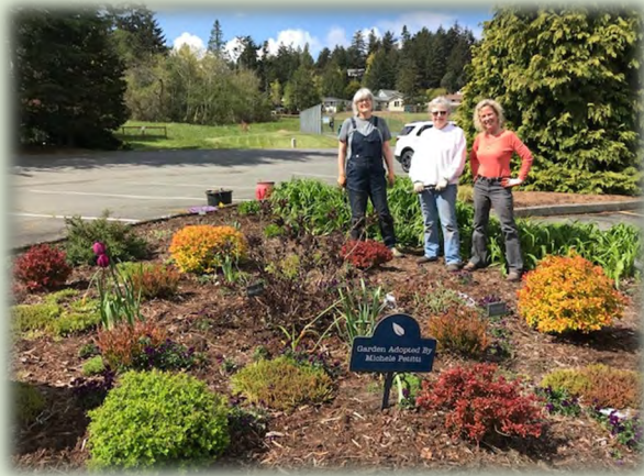
Shelter Bay Garden Club members and their beautiful garden work