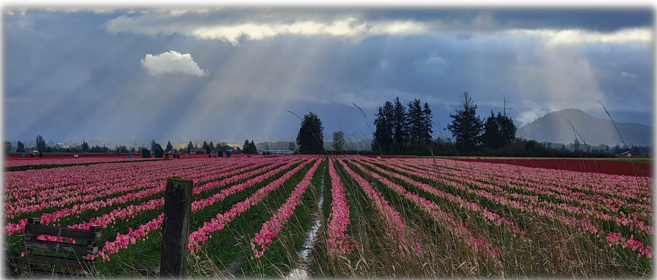
BLESSED FIELDS OF TULIPS—BEST RD 2022