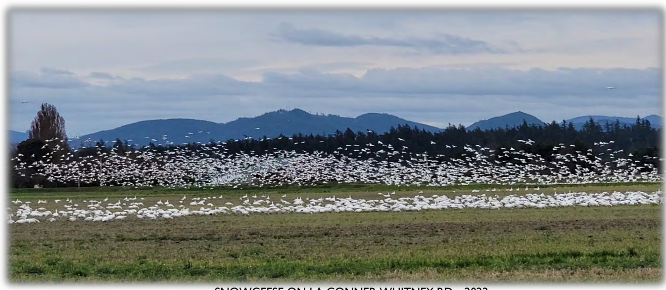
SNOWGEESE ON LA CONNER WHITNEY RD-2022