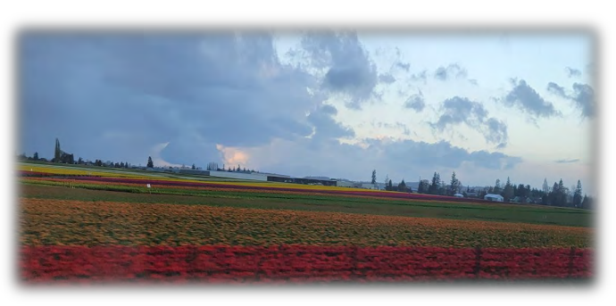
Tulip Festival - The Month of April Traveling? Expect Traffic Delays! For more information on all the local Tulip Festival Happenings visit Www.tulipfestival.org/events/ TULIP FACT:

I wandered lonely as a cloud that floats on high o'er vales and hills, when all at once I saw a crowd, a host, of golden daffodils; beside the lake, beneath the trees, fluttering and dancing in the breeze" - Williams Wordsworth