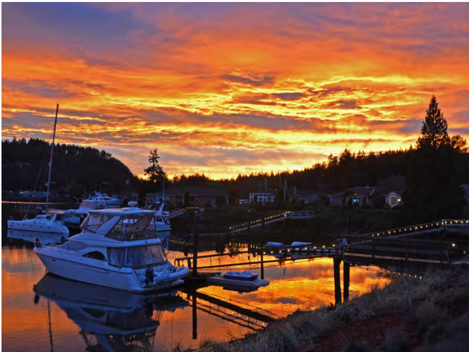
SHELTER BAY HARBOR WINTER SUNSET

Reminder: Shelter Bay Community Inc. is following the Swinomish Indian Tribal Community Coronavirus guidelines. Swinomish Public Health confirmed 18 new cases from January 20-24th for a total of 661 cases and four deaths. Get your free at-home covid-19 tests at: COVIDTests.gov and Drive-Thru testing at Skagit County Fairgrounds Monday-Friday 12-7 p.m. NO APPOINTMENT or INSURANCE REQUIRED. Or go to skagitcounty.net/Departments/HealthDiseases/coronavirusTESTsites.htm for more Skagit County testing sites.