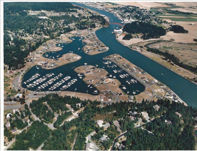
Aerial View of Shelter Bay Marina & the Swinomish Channel [ca. 1980s]

CALL THE OFFICE & TELL US HOW YOU WOULD LIKE TO SUPPORT YOUR COMMUNITY!