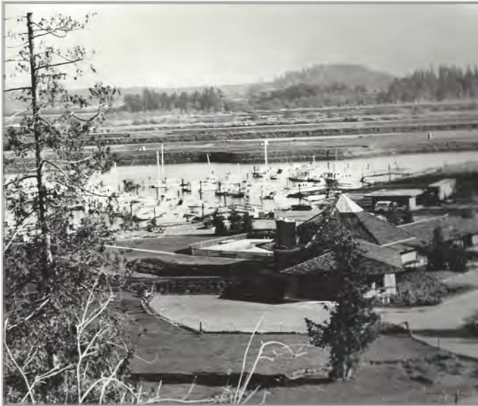
Historic Hillside View of Shelter Bay Marina & Clubhouse