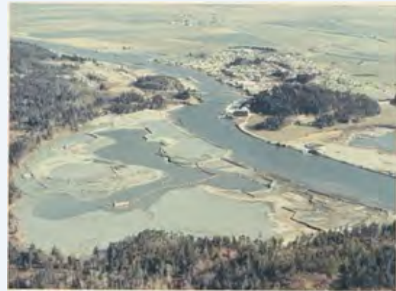
Indian Bay - Late 1969