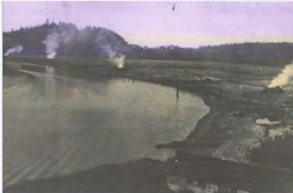
Indian Bay - Development Begins October 1968