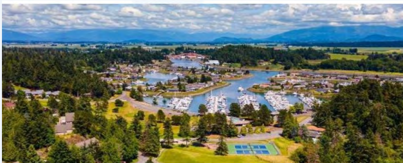
Shelter Bay - c. 2018

Clearing of the property for Shelter Bay, formerly known as Indian Bay, began in late 1968. Legislative approval early that summer by Congress enabled the Swinomish Tribe to lease property for the development. Osberg Construction Co. of Seattle was scheduled to build 500 homes.