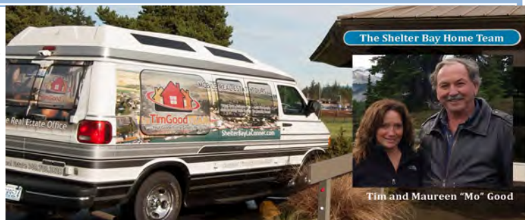
The Shelter Bay Home Team